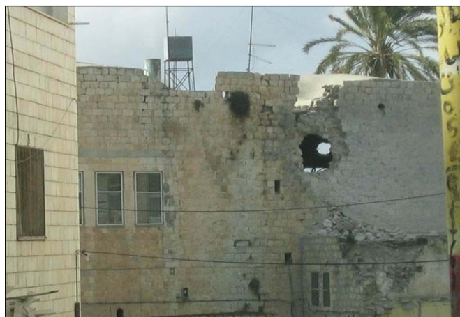
Photo 1 - Qasr Abdel-Hadi

A number of other buildings in the old city suffered structural damage from explosives. 3 houses were destroyed, and the families who lived in them have lost all their belongings. 35 houses were rendered uninhabitable. 10 houses were partially damaged. Tens of houses had their windows blown out. 38 families were directly affected by the operation. The walls of several other homes and buildings were knocked down or blown up during IDF searches.