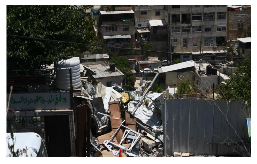
Shop demolished by Israeli authorities, Silwan, East Jerusalem. 29 June 2021.

According to the Office of the High Commissioner for Human Rights (OHCHR), during the escalation in Gaza,