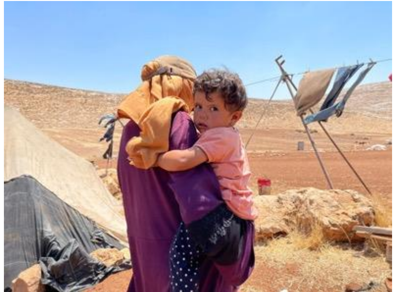
Palestinians of Ras al Tin staying in borrowed tents, two weeks after the confiscation of most community structures by the Israeli authorities.

On 14 July, the authorities, confiscated 49 structures in the Palestinian herding community of Ras al Tin (Ramallah). Thirteen households, comprising 84 people, including 53 children, were displaced and are at heightened risk of forcible transfer. Indeed, they have not left the area, and are leaving in borrowed tents. The seized structures included homes, animal shelters and solar power systems. Other items, including water tanks, tractors with trailers and animal fodder were also confiscated by the Israeli forces, with some being reportedly heavily damaged in the process. According to the community members, Israeli officials ordered the community, which is in Area C of the West Bank, to move to Area B.