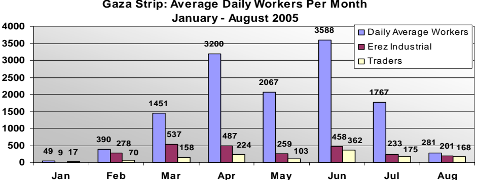
Gaza Strip: Average Daily Workers Per Month