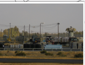
KEREM SHALOM (KARMABOU SALEM) Open five days a week for movement of authorized goods.