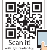
Scan it! with QR reader App