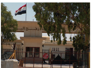
RAFAH (AL 'AWDA) Open six days a week for the movement of authorized persons.